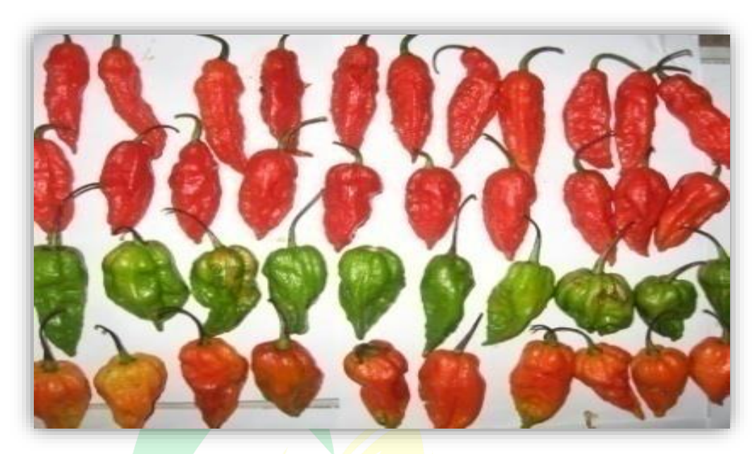
Different types of local cultivars of King Chilli